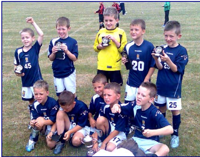
Pleased as punch – Academy lift trophy

Another trophy on the table ....as the 'little uns' pulled off another fantastic tournament win in Sunny (or